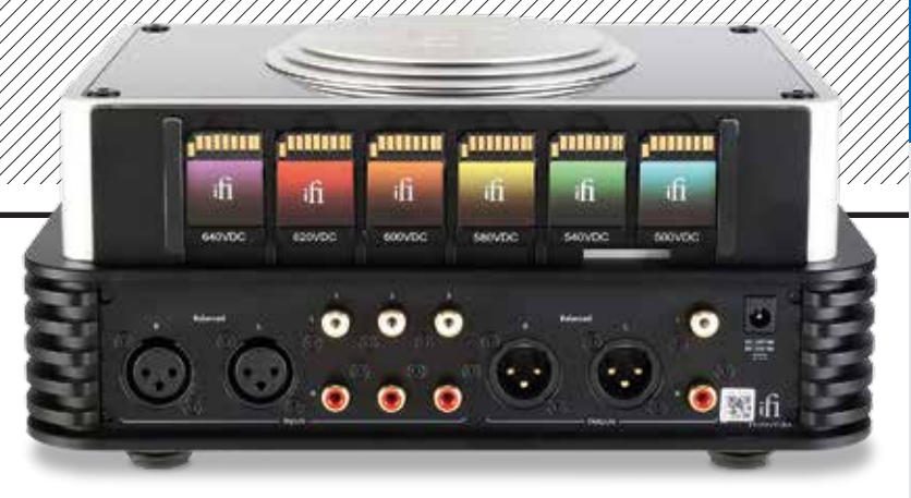
ABOVE: No hint of 'digital' – just one balanced (XLR) and three single-ended (RCA) inputs with single sets of (variable) RCA and XLR preamp outs. The biasing resistors for different electrostatic 'phones are stored behind the chassis (reversed here)

upcoming II Viaggio [PIAS 96kHz/24-bit]. It was a nice embellishment that I liked with this album but didn't miss when playing others.