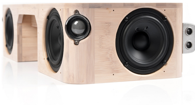
Left: Three of the four main drivers and one tweeter are visible in this image, within their bamboo enclosure. The Aurora's outer enclosure, with its distinctive bamboo fins, sits over the top of this.

The net result is a remarkably coherent performance with a silky-smooth frequency response, an out-of-the box soundstage and bass that delves far deeper than most table top systems can muster.